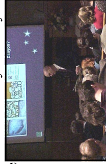
Computer, video projector, and a 12 ft screen team up with audience participation